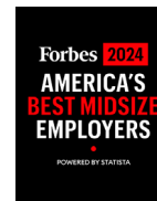
Forbes America's Best Midsize Employers list 2024