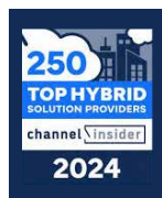
Channel Insider Hybrid Solution Provider 250-2024