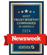
Most Trustworthy Companies in America 2024