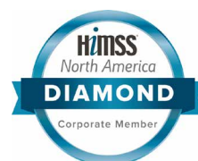
HIMSS Diamond Corporate Member