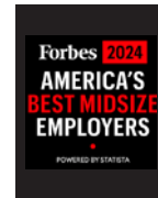
Forbes America's Best Midsize Employers list 2024