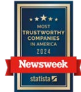
Most Trustworthy Companies in America 2024